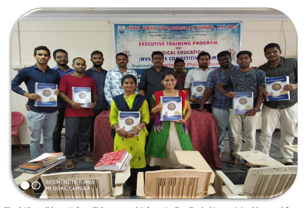
Total 12 candidates (4 from Telangana and 8 from Andhra Pradesh) were joined here and 5 got selected for interview for NVS and 6 were qualified the NVS exam and two were not appeared the exam. I supplied Material to the Students and uploaded in my website "kyathi physical education"